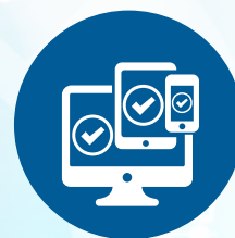
Advisory Services p 7